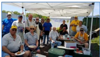
Bausch & Lomb Picnic