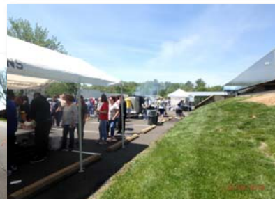
WG Baseball Season Opening Day Hot Dogs