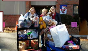
Toy Delivery to Epworth