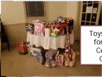
Toys Collected for Epworth Center for Children