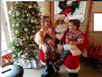
Pancakes with Santa