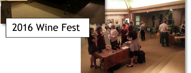
2016 Wine Fest