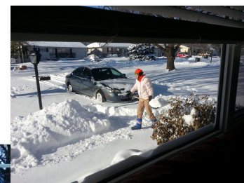
Just a reminder! 2014