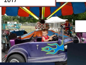
They had fun!