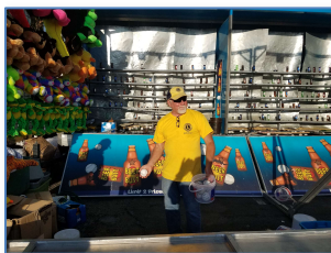
He got fired after 1 hour!