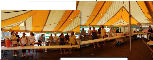
They waited to serve!