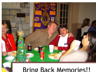
Bring Back Memories!! 2013