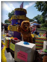
Carnival & BBQ 2017