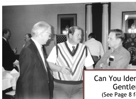
Can You Identify These Gentlemen? (See Page 8 for Answer)