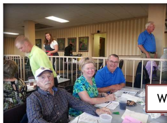
What Have We Here????