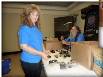
Eye Wrap - Maplewood