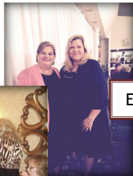
End of Other's Reign