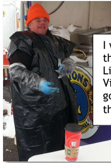
I wonder if the WG Library Videographer got a shot of this.

Lion Pat was not only cold, but he kept dry, sorta.