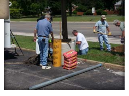
New BBQ Electricals