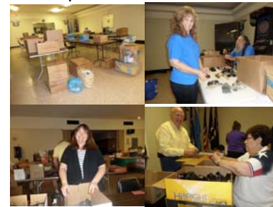
Maplewood Eye Wrap May 9, 2015

Usable glasses are then distributed to the poor around the world.