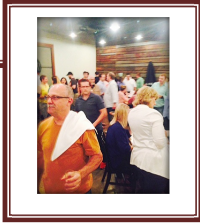
Webster Groves Lions Beer Tasting Event May 30, 2015 A total of 85 "tasters" participated. A great time was had by all. Many thanks to the volunteers and contributors.