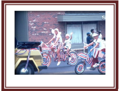
90 th Anniversary Carnival & BBQ July 1 - 4, 2015