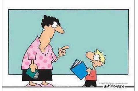
It's called reading . It's how people install new software into their brains.

Keep an eye out for the next squeal! If you have any news or pictures please submit to Lion Fred!